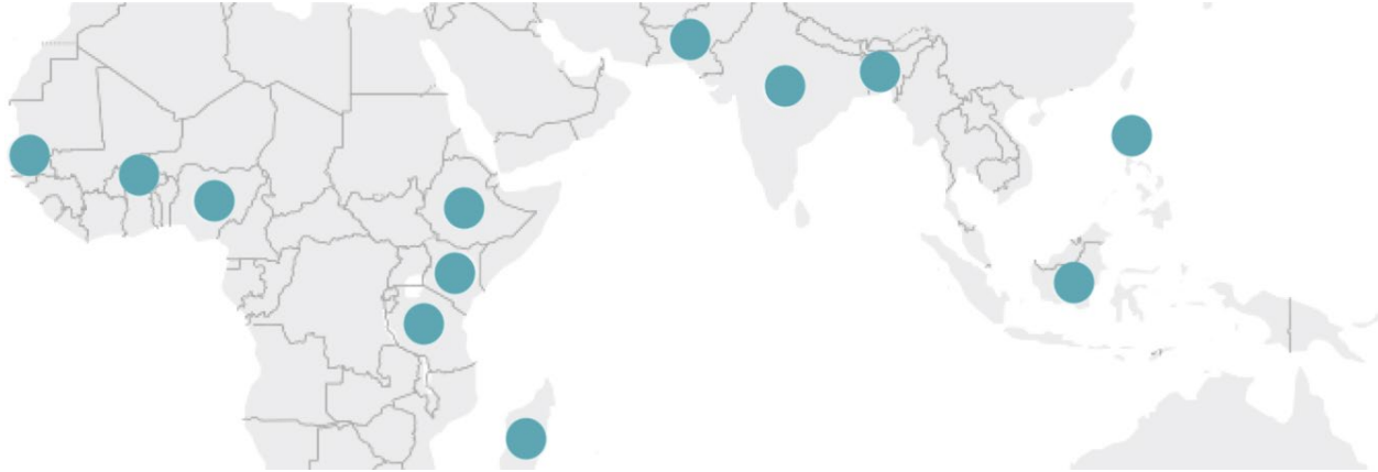
Figure 1: 12 countries included in this analysis are Bangladesh, India, Pakistan, Philippines, Indonesia, Burkina Faso, Ethiopia, Madagascar, Nigeria, Kenya, Senegal, Tanzania

The key assumptions in the cost-effectiveness analysis include: